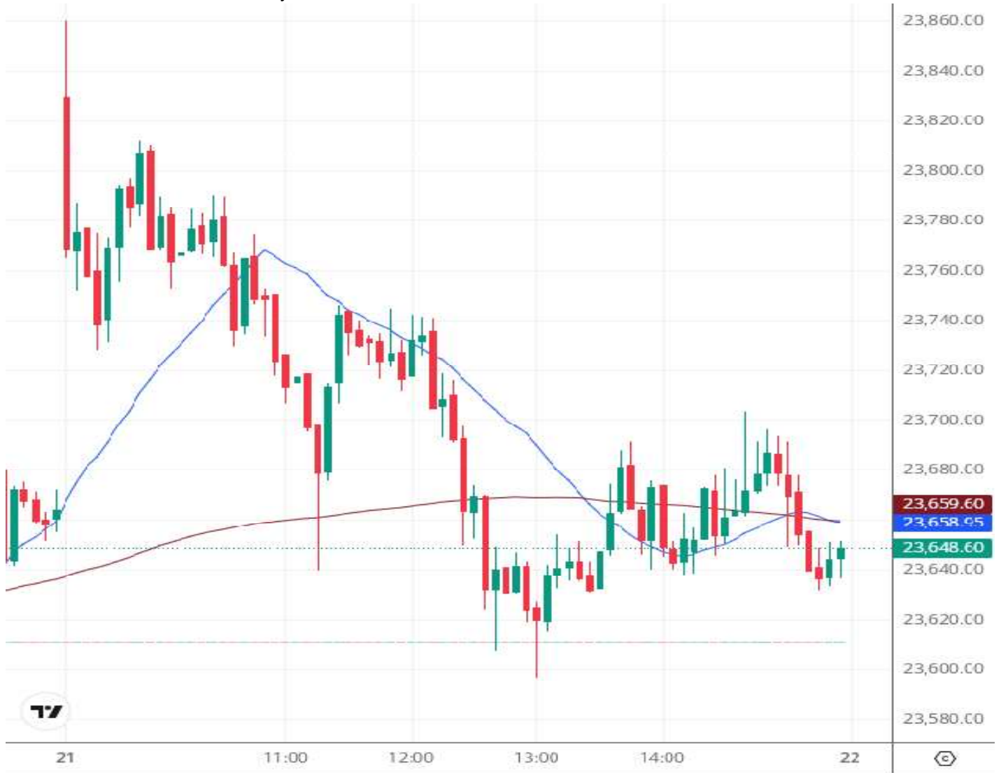
Nifty50 Technical Chart View

Disclaimer: These are all imaginary lines, which possibly act as support or resistance in the chart.