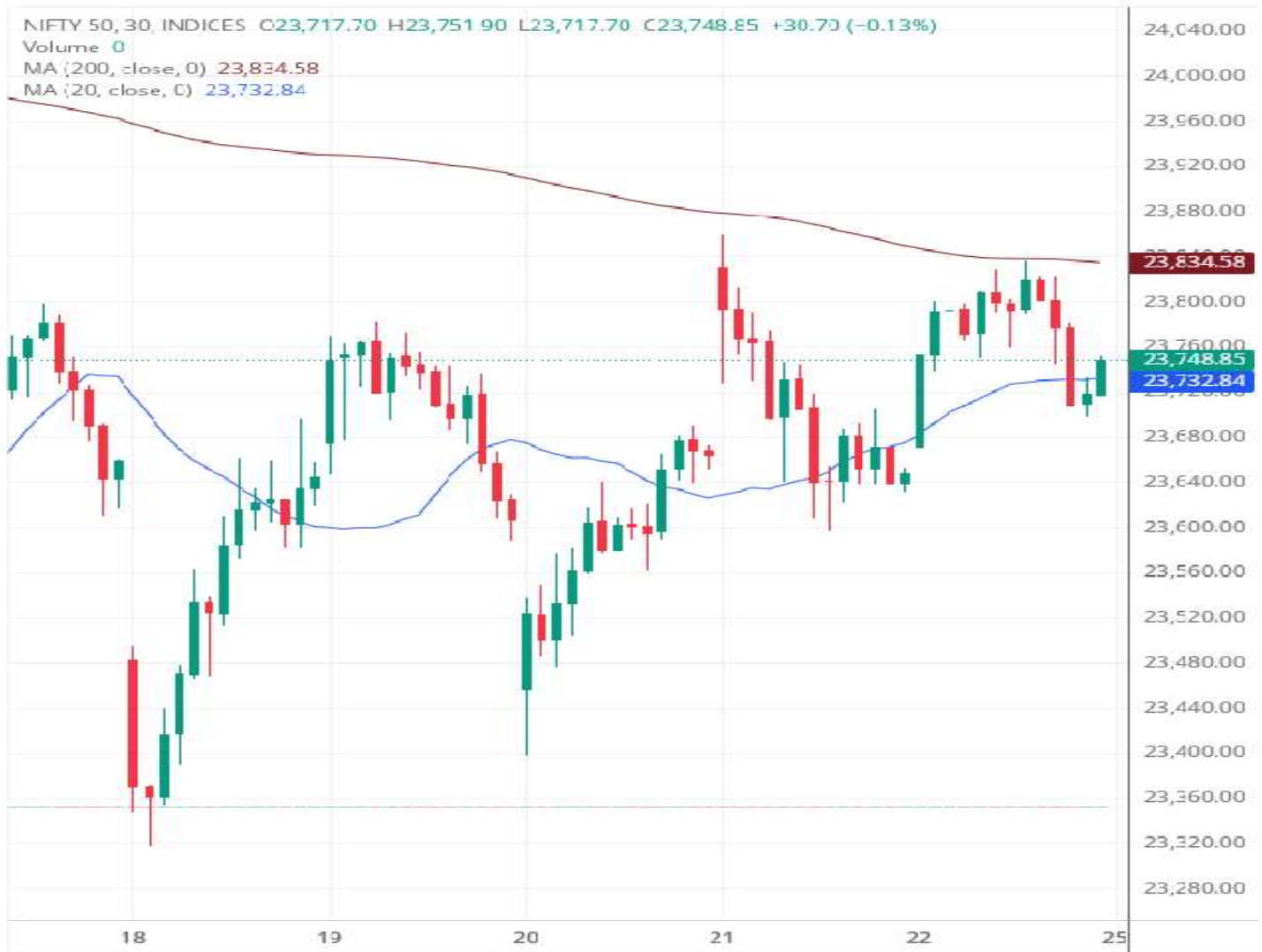
Nifty50 Technical Chart View

Disclaimer: These are all imaginary lines, which possibly act as support or resistance in the chart.