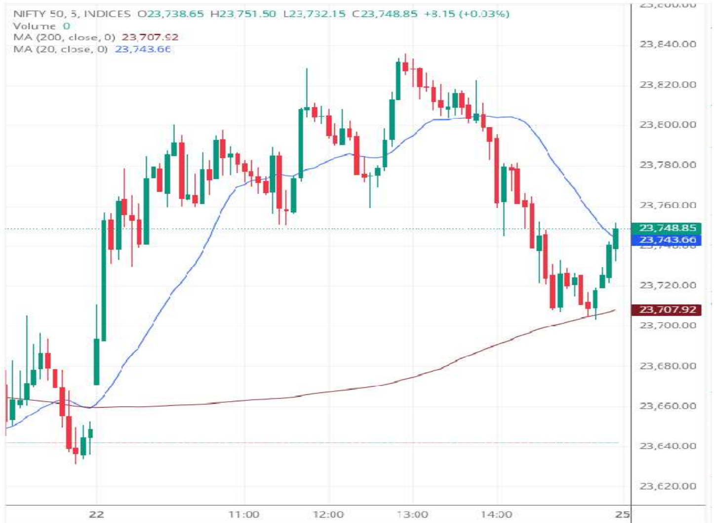
Nifty50 Technical Chart View

Disclaimer: These are all imaginary lines, which possibly act as support or resistance in the chart.