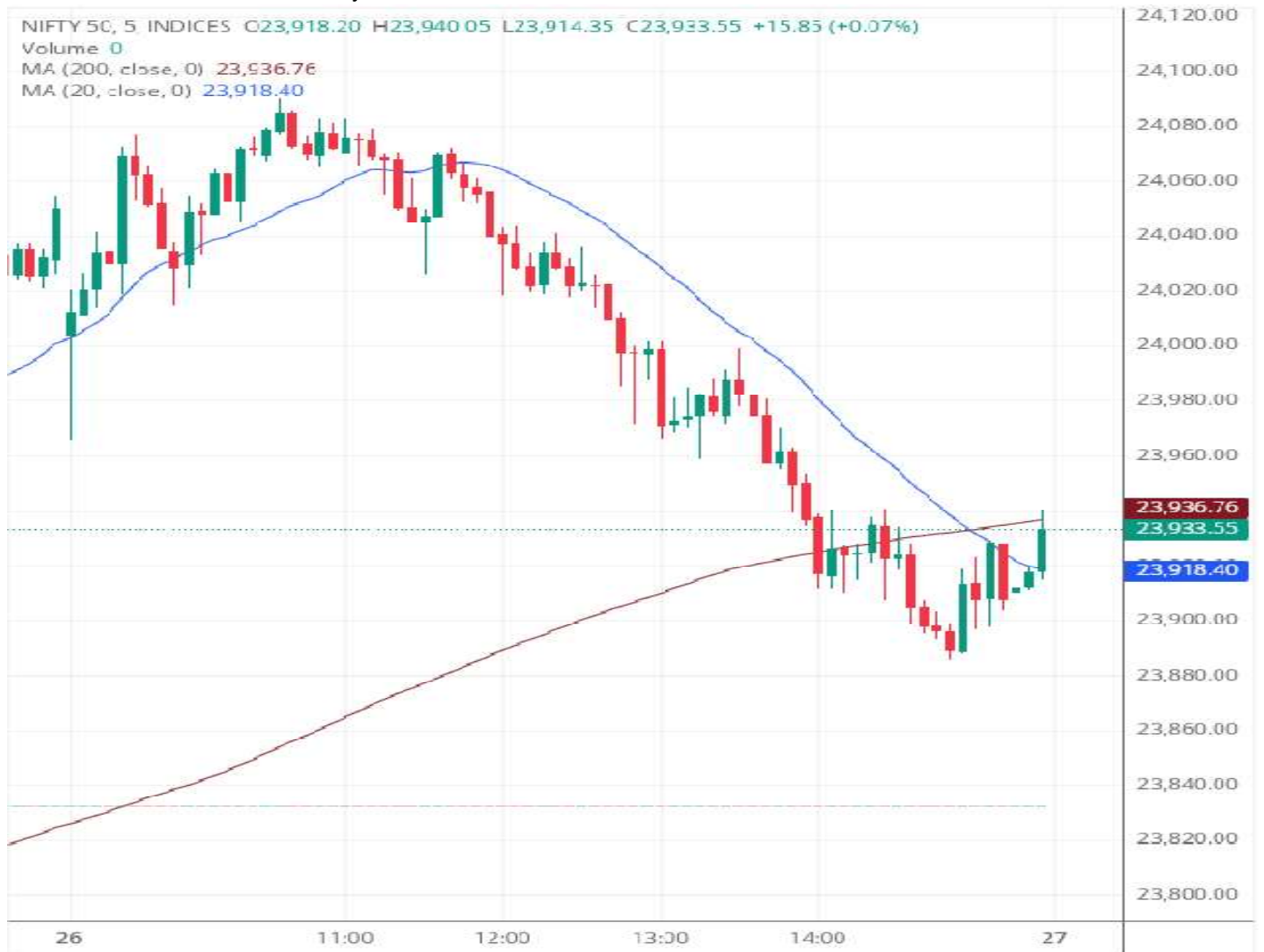
Nifty50 Technical Chart View

Disclaimer: These are all imaginary lines, which possibly act as support or resistance in the chart.