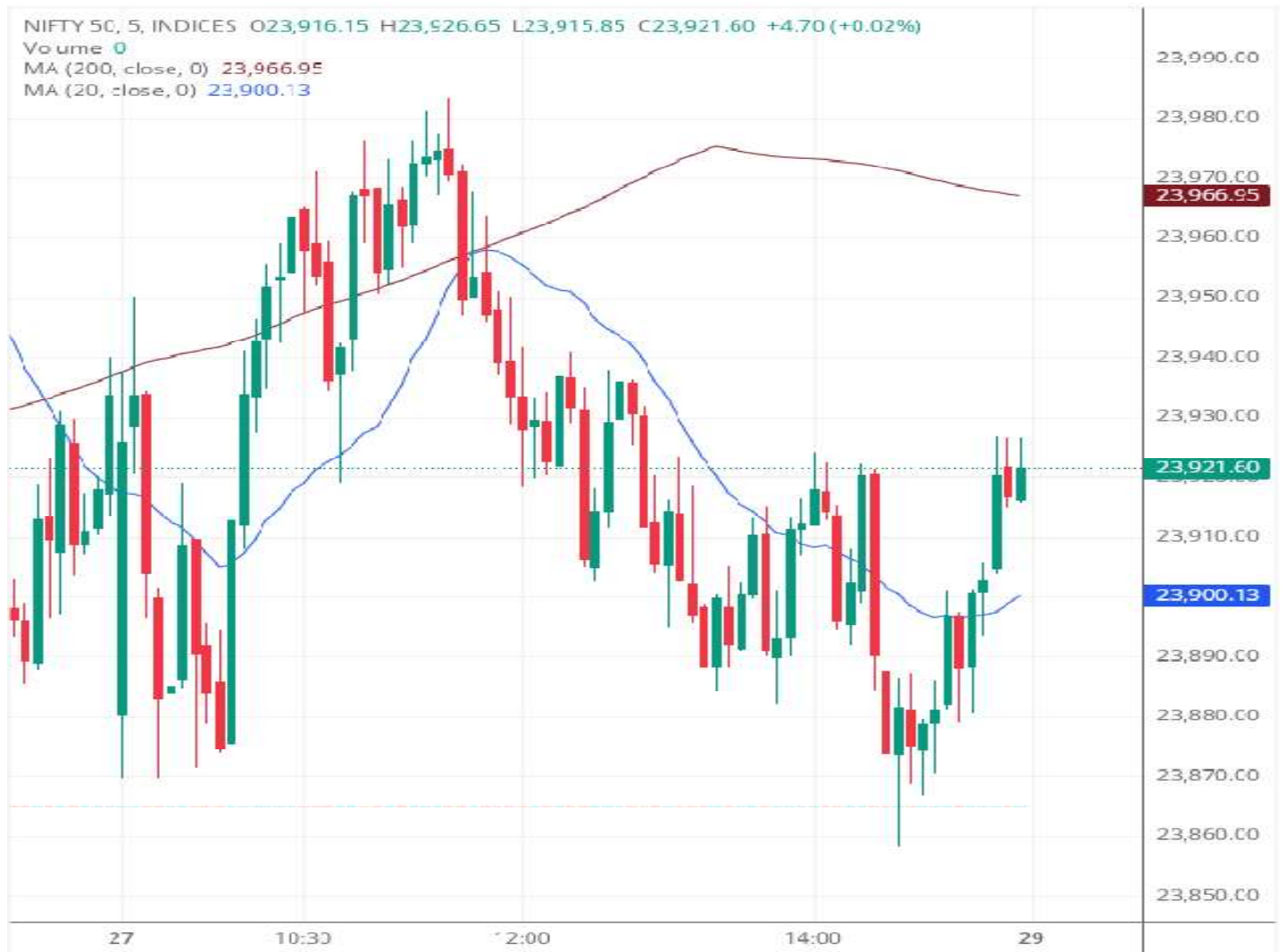
Nifty50 Technical Chart View

Disclaimer: These are all imaginary lines, which possibly act as support or resistance in the chart.